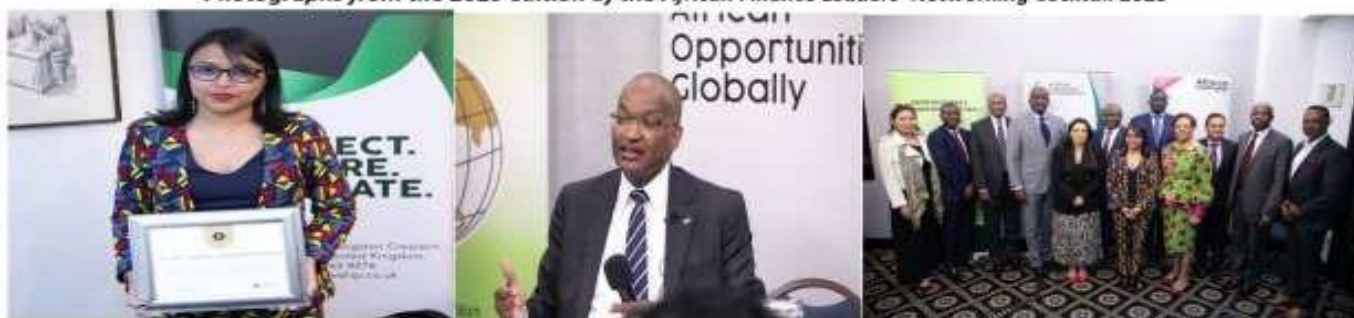
H.E. Rindra Rabarinirinarison, Minister for Economy & Finance, Madagascar