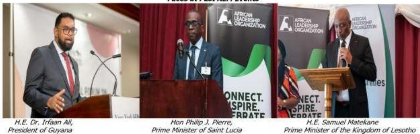
Faces at Past ALM Events

This recognition honours your distinguished leadership as Rector of the University of Kinshasa, and your significant contribution to advancing higher education in the Democratic Republic of the Congo. Under your